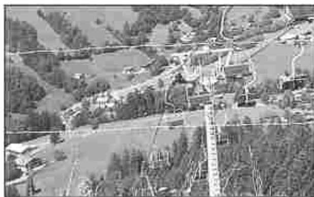
Fig. 7.1: Ropeway and Cable cars in Austria

In general, the old and elementary forms like the human porter, pack animal, cart or wagon are the most expensive means of