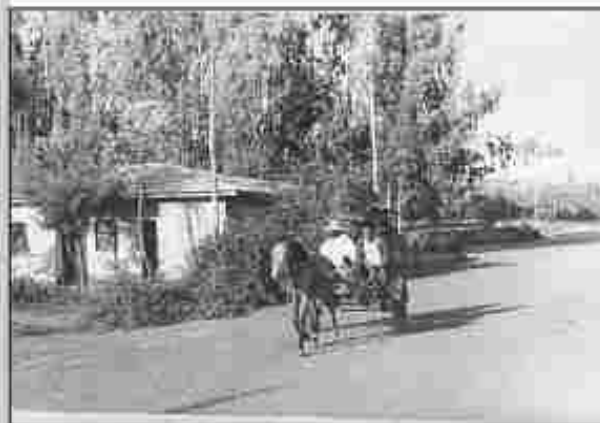
Fig. 7.2: A horse cart in a village Tefki, in Ethiopia

Horses are used as a draught animal even in the Western countries. Dogs and reindeer are used in North America, North Europe and Siberia to draw sledges over snow-covered ground. Mules are preferred in the mountainous regions; while camels are used for caravan movement in deserts. In India, bullocks are used for pulling carts.