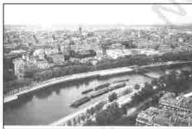
Fig. 7.8: The view of Seine River from the Eiffel Tower (One can see how the river has become an important inland waterway)