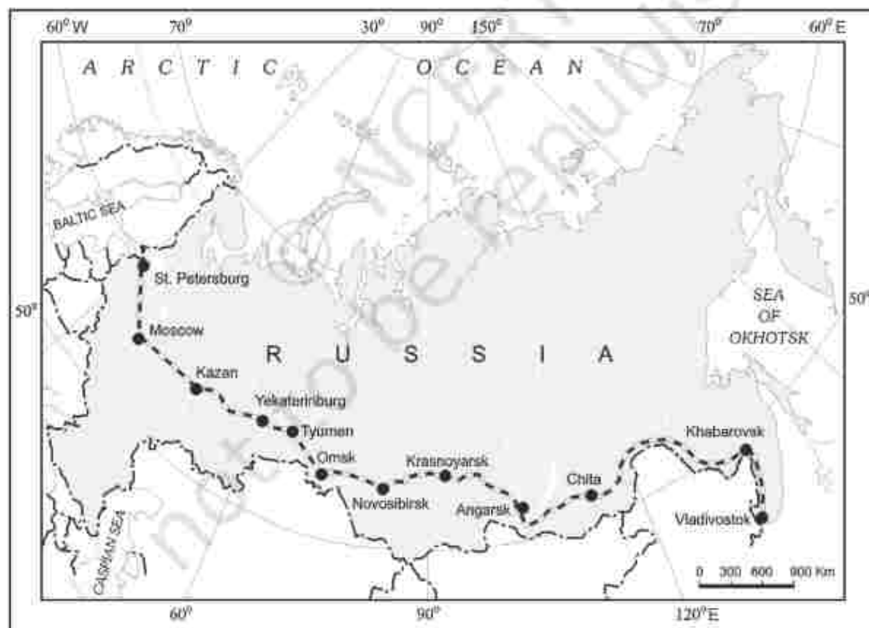
Fig. 7.5: Trans-Siberian Railway

This rail-line connects New York on the Atlantic Coast to San Francisco on the Pacific Coast passing through Cleveland, Chicago, Omaha, Evans, Ogden and Sacramento. The most valuable exports on this route are ores, grain, paper, chemicals and machinery.