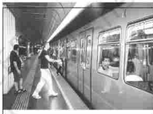
Fig. 7.4: Tube Train in Vienna

Commuter trains are very popular in U.K., U.S.A, Japan and India. These carry millions of passengers daily to and fro in the city. There are about 13 lakh km of railways open for traffic in the world.