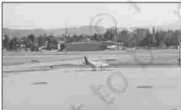
Fig. 7.15: An Aeroplane at Salzburg Airport

Air transport is the fastest means of transportation, but it is very costly. Being fast, it is preferred by passengers for long-distance travel. Valuable cargo can be moved rapidly on a world-wide scale. It is often the only means to reach inaccessible areas. Air transport has brought about a connectivity revolution in the world. The frictions created by mountainous snow fields or inhospitable desert terrains have been overcome. The accessibility has increased. The airplane brings varied articles to the Eskimos in Northern Canada unhindered by the frozen ground. In the Himalayan region, the routes are often obstructed due to landslides, avalanches or heavy snow fall. At such times, air travel is the only alternative to reach a place. Airways also have great strategic importance. The air strikes by U.S. and British forces in Iraq bears testimony to this fact. The airways network is expanding very fast.