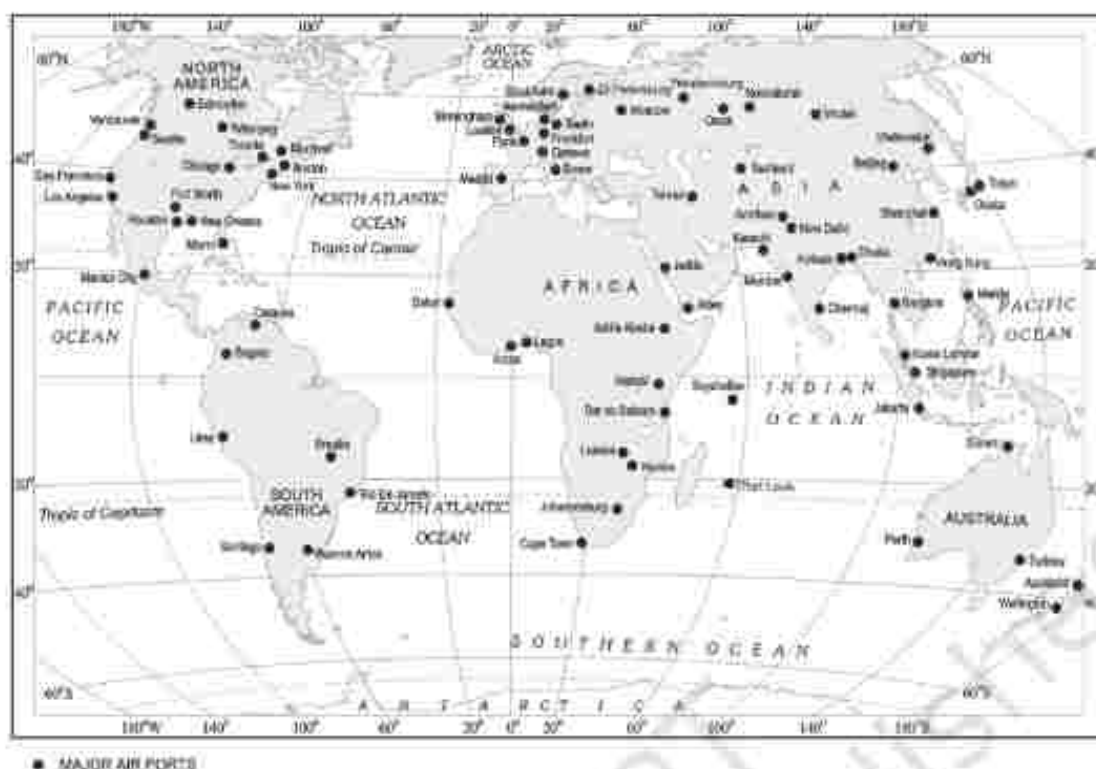
Fig. 7.16: Major Airports

consuming areas. Big Inch is one such famous pipeline, which carries petroleum from the oil wells of the Gulf of Mexico to the North-eastern States. About 17 per cent of all freight per tonne-km. is carried through pipelines in U.S.A.