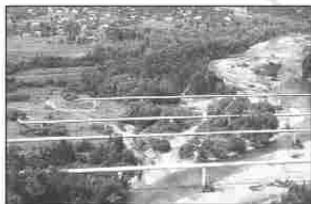
Fig. 7.17: Pipelines transporting natural gas in Ukraine

consuming areas. Big Inch is one such famous pipeline, which carries petroleum from the oil wells of the Gulf of Mexico to the North-eastern States. About 17 per cent of all freight per tonne-km. is carried through pipelines in U.S.A.