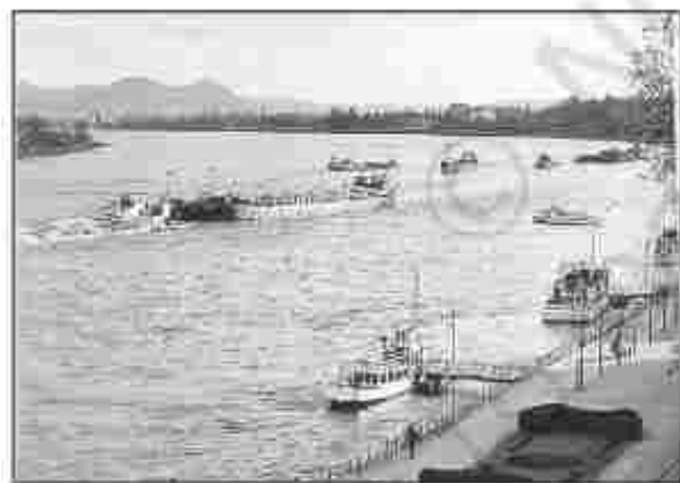
Fig. 7.13: The Rhine Waterway

The Rhine flows through Germany and the Netherlands. It is navigable for 700 km from Rotterdam, at its mouth in the Netherlands to Basel in Switzerland. Ocean-going vessels can reach up to Cologne. The Ruhr river joins the Rhine from the east. It flows through a rich coalfield and the whole basin has become a prosperous manufacturing area. Dusseldorf is the Rhine port for this region. Huge tonnage moves along the stretch south of the Ruhr. This waterway is the world's most heavily used. Each year more than 20,000 ocean-going ships and 2,00,000 inland vessels exchange their cargoes. It connects the industrial areas of Switzerland, Germany, France, Belgium and the Netherlands with the North Atlantic Sea Route.