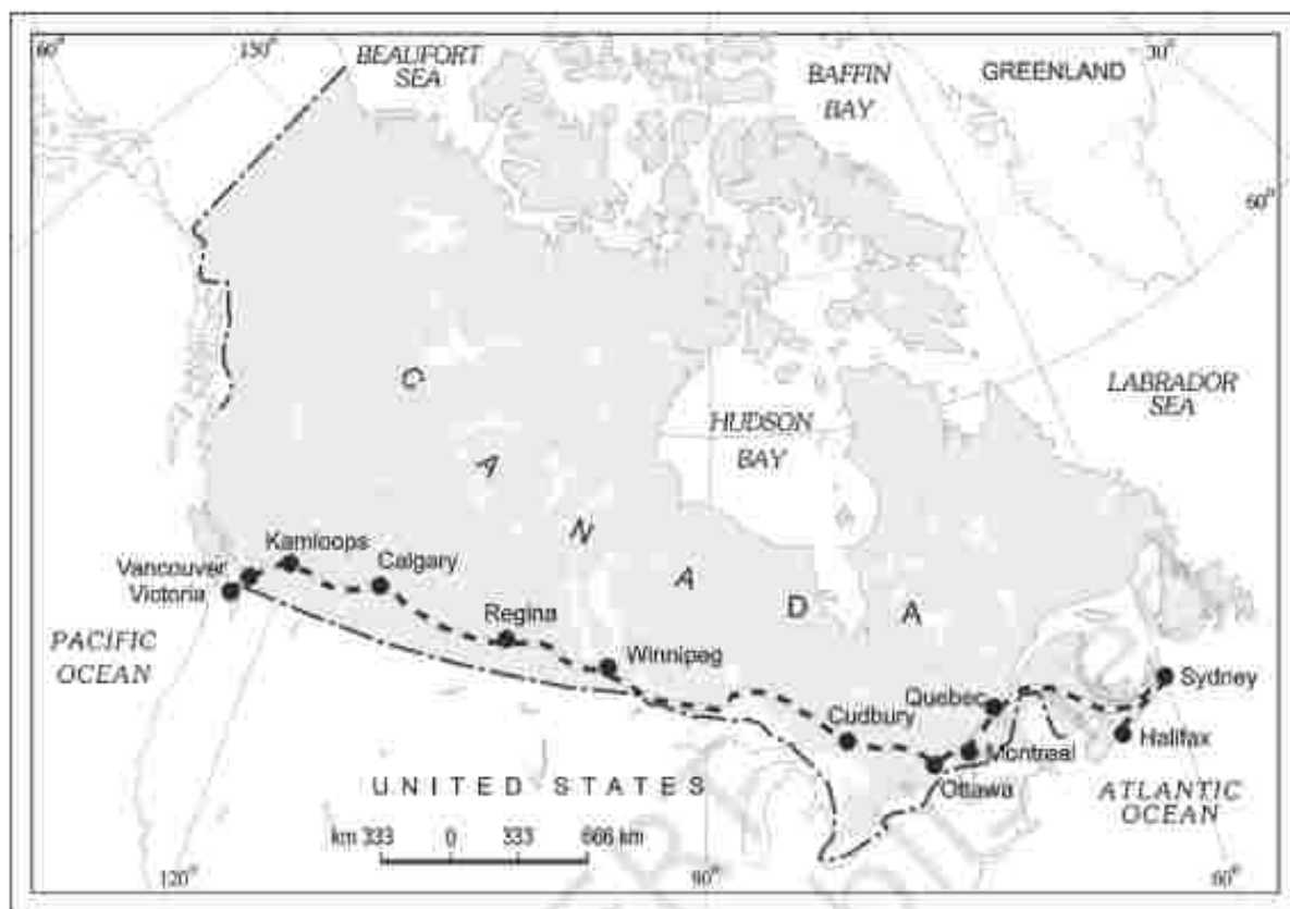
Fig. 7.6: Trans-Canadian Railway