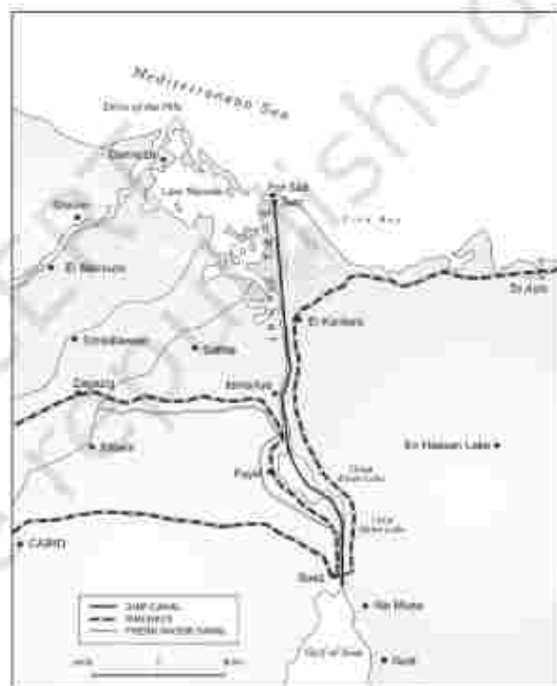
Fig. 7.10 : Suez Canal.

sea-route distance between Liverpool and Colombo compared to the Cape of Good Hope route. It is a sea-level canal without locks which is about 160 km and 11 to 15 m deep. About 100 ships travel daily and each ship takes 10-12 hours to cross this canal. The tolls are so heavy that some find it cheaper to go by the longer Cape Route whenever the consequent delay is not important. A railway follows the canal to Suez, and from Ismailia there is a branch line to Cairo. A navigable fresh-water canal from the Nile also joins the Suez Canal in Ismailia to supply fresh-water to Port Said and Suez.