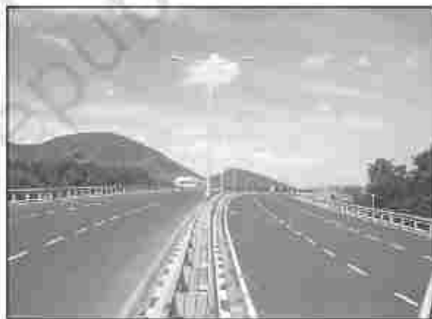
Fig. 7.3 : Dharmavaram Tunt National Highway, India

Highways are metalled roads connecting distant places. They are constructed in a manner for unobstructed vehicular movement. As such these are 80 m wide, with separate traffic lanes, bridges, flyovers and dual carriageways to facilitate uninterrupted traffic flow. In developed countries, every city and port town is linked through highways.